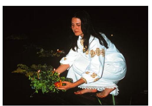
Flower wreaths are launched as part of fortune telling done at the fest of Ivan Kupalo.

There was a traditional belief that on the night of Ivan Kupalo ferns produced blooms (it is well known that ferns never grow flowers). The one who spotted