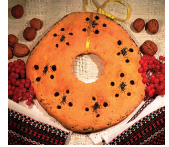
Kalyta, a flat dry bread used in playing ritual game kalyta.

A blind eye was turned to mischief and pranks which were played by the young people on the Feast Day of St Andrew — such pranks would be punished on any other day. If it was known that in a certain household, there was an unmarried young woman whose parents did not allow her to go out with boys, the young men, for example, could take the gate off its hinges, take apart a fence or a wagon, steel a plough and throw it on the roof or take it to a different place in the village. Ethnographers believe that such pranks were part of rituals connected with courting and marriage proposals — such barriers, for example, as gates or fence were removed "to clear the way to marriage."