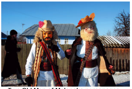
Two Old Men of Malanaka personages in the village of Vashkivtsi