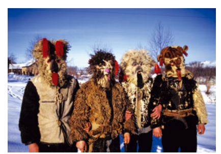
The Malanka Bears — the young men who are chosen to play their roles must be physically very strong. The village of Velyky Kuchuriv.

Depending on the size of a village, Malanka performances can go on through the night until midday the next day. In some villages, the Malanka performers make a big bonfire into which they throw the spoiled masks and straw which was used for stuffing the hunches of "hunchbacks," and then they, one by one, jump over the fire in an age-old ritual.