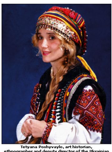
ethnographer and deputy director of the Ukrainia Folk Culture Center Muzey Ivana Honchara.

Wedding in the Ukrainian countryside used to be—and to a large extent still is—an event that involved the whole village in which it took place, and lasted for days on end. The traditional marriage rites, the rituals of the wedding ceremony and of the wedding party were strictly observed. In recent years, some of the ancient wedding traditions have begun to be coming back.