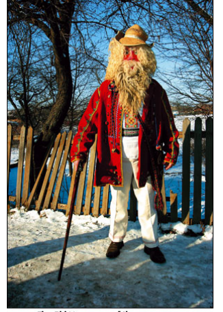
The Old Man — one of the personages in the Malanka performances. The town of Vashkivtsi, Chemivtsi Oblast.

In the evening before the Malanka night, young men put on all kinds of costumes, some of them weird and bizarre — Devils, Warriors, Police, Witches, Old Women and Men, Death, Blacksmith, Jews, Gypsies, Turks, Hutsuls and representatives of other nationalities. All of these people in their disguise move from house to house performing their little plays and improvisations for those who would care to see their performance. They make very much noise, and in addition to music, they play practical jokes on people — but no one ever gets harmed in any