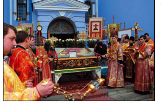
A religious service in honour of St Varvara in the Mykhailivsky Zlatoverkhy Cathedral.