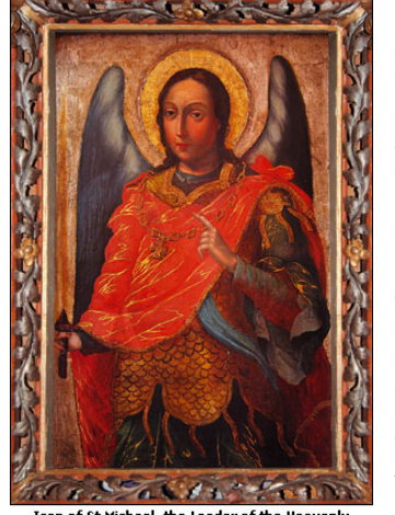
Icon of St Michael, the Leader of the Heavenly Host. The icon comes from the iconostasis of the Church of St Michael in the village of Dorohynka in the Land of Kyivshchyna. Early 18th century.

On the ancient coat of arms of Kyiv you can see St Michael holding a sword. In Ukrainian icons, St Michael is usually shown trampling the devil underfoot, and holding a green branch of a date tree in one hand and a spear with a white banner or a burning sword in the other. As a fighter against evil, St Michael was believed to control the lightning and the wind.