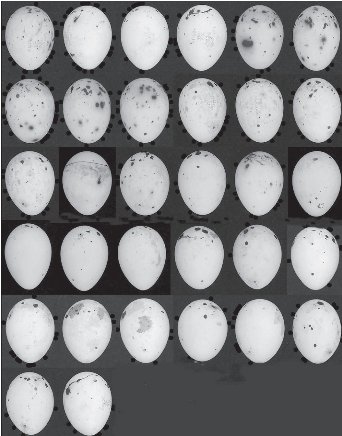
Figure 3. A collection of eggs of Fringilla coelebs Linaeus, 1758

cal) end (clo); a pattern placed evenly (even); pattern elements placed on both the blunt and sharp ends (info/clo); a pattern forms a belt in the equatorial zone (equat) (Mytiai, 2008).