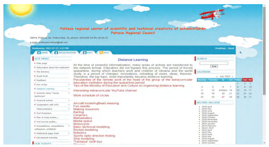
Fig. 2. «Distance learning» page of the website of the Poltava Regional Center of Scientific and Technical Creativity of Pupil Youth of the Poltava Regional Council

The organization of distance learning is highlighted on the website pages (Fig. 2).