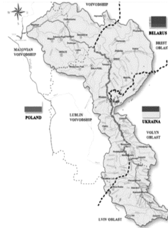
Fig. 1. The Western Bug River Basin ( http://esnuir.eenu.edu.ua/handle/123456789/12934 )

the problem with leachate ponds, and the planning activities to be solved. A review of scientific literature and technical documentation has identified several risks needed to be considered within EIA. They are grouped below.