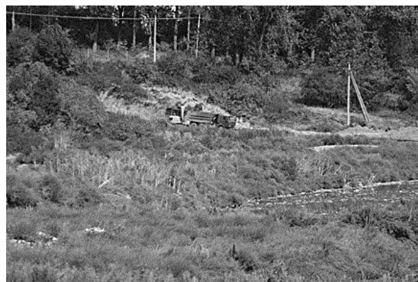
Fig. 4. Grybovychi landfill. Illegal soil mining ( https://zaxid.net/news/ )

properties including hydro-physical properties and organic content, for the methane degradation layer.