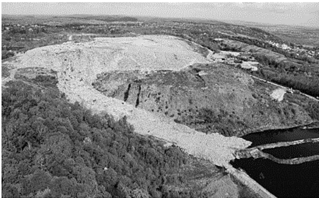
Fig. 2. Avalanche cone of the landfill body displacement (about 100,000 m 3 ), 2016 (Puhach, 2018)